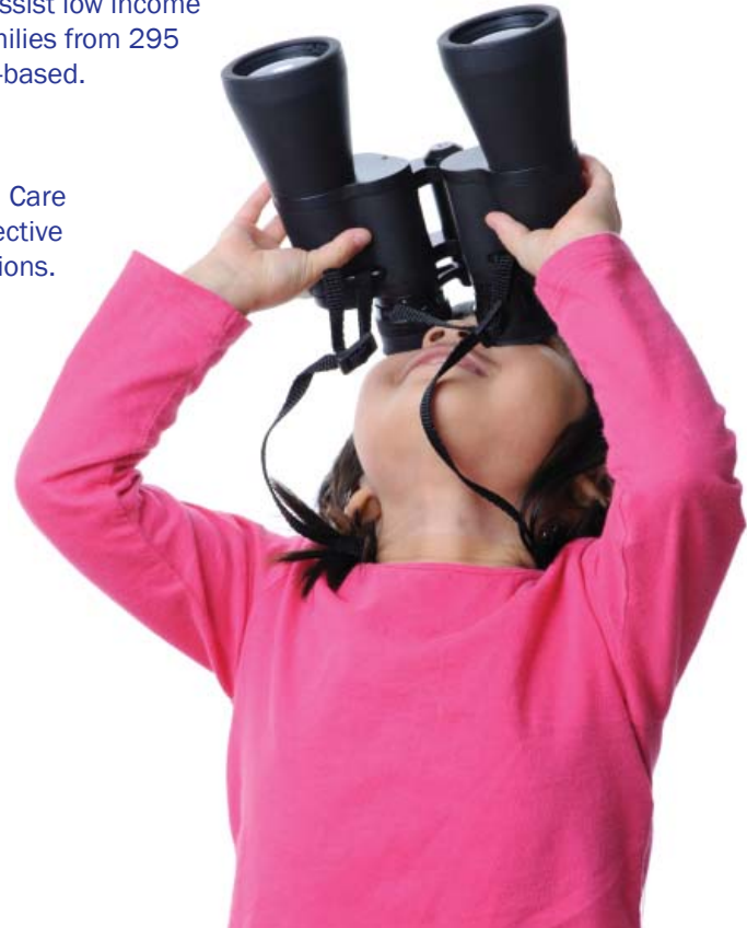
Number of Child Care Programs in the Capital Region

The Parent Services Department of the Council is also responsible for community outreach. The Council participated in over 20 community events this year. As a result, over 10,000 palm cards, 20,000 summer camp catalog flyers, and over 14,000 before/after school care postcards were distributed to agencies, school districts, and businesses to educate parents and caregivers about quality child care options.